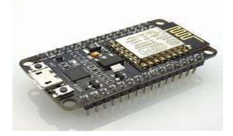
Fig -4.1: ESP8266

The chip first came to the attention of western makers in August 2014 with the ESP-01 module, made by a third-party manufacturer Ai-Thinker. This small module allows microcontrollers to connect to a Wi-Fi network and make simple TCP/IP connections using Hayes-style commands. However, at the time there was almost no English-language documentation on the chip and the commands it accepted. The very low price and the fact that there were very few external components on the module, which suggested that it could eventually be very inexpensive in volume, attracted many hackers to explore the module, chip, and the software on it, as well as to translate the Chinese documentation.