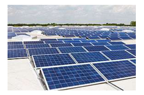
Fig -2.1: Solar Panel

A single solar module can produce only a limited amount of power; most installations contain multiple modules. A photovoltaic system typically includes an array of photovoltaic modules, an inverter, a battery pack for storage, interconnection wiring, and optionally a solar tracking mechanism.