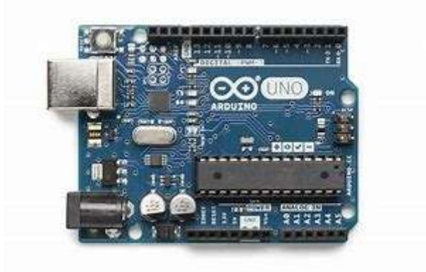
Fig -3.1: Arduino UNO

The Atmel AVR® core combines a rich instruction set with 32 general purpose working registers. All the 32 registers are directly connected to the Arithmetic Logic Unit (ALU), allowing two independent registers to be accessed in a single instruction executed in one clock cycle. The resulting architecture is more code efficient while achieving throughputs up to ten times faster than conventional CISC Microcontroller