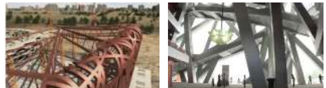
Fig 3 - Detailing of the Trusses

Besides the aesthetic value of this network, we must emphasize the role of the structural elements of metal, which are interlacing and are mutually supporting. Although it produces the impression of a casual and almost natural course, the meeting of the various elements and the direction we take in the nest, are the result of precise calculations.