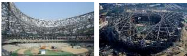
Fig 2- Construction photo of Stadium

Construction of the stadium proceeded in several distinct phases, the first phase involving the construction of a concrete supporting structure upon the concrete foundations laid for the construction site. This was followed by the phased installation of the curved steel frame surrounding the stadium, which is largely self-supporting. This phased installation involved the interconnection of sections of the curved steel frame that were constructed in Shanghai and transported to Beijing for assembly and welding. The entire structure of interconnected sections was welded together as the primary means of interconnection used to assemble the entire surrounding nest structure. Upon removal of the supporting columns used for the purpose of expediting the assembly of the interconnecting sections, the completed nest structure as a whole settled approximately 27 cm to attain full stability before the interior design and construction of the stadium could be installed and completed.