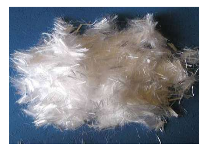
Fig. No. 1 Polypropylene fibre