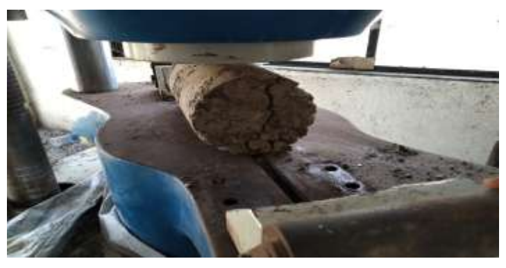
Fig -1: Split Tensile test on column

Table no. 1 and 2 shows that compressive strength of M20 grade concrete for 7 and 28 days resp. The strength of polyester and polypropylene is increase by 34.37% and 14.84% for 7 days and 28 days resp.