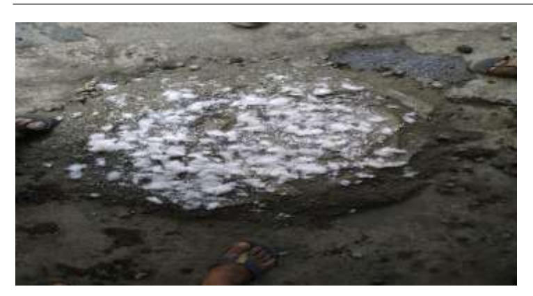
Fig -3: Polymer Fibre