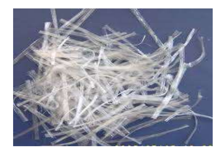
Fig. No. 2 Mesh geometry