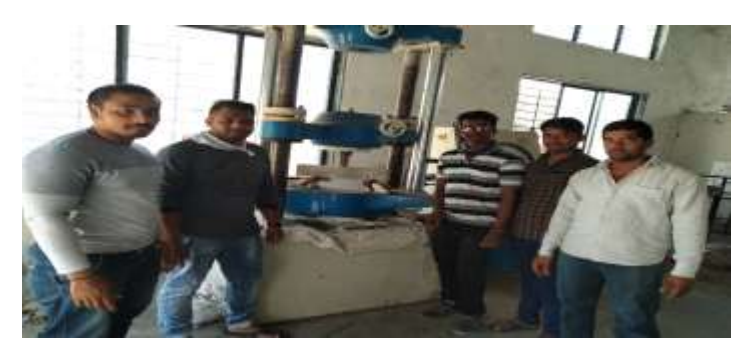
Fig -2: UTM Test