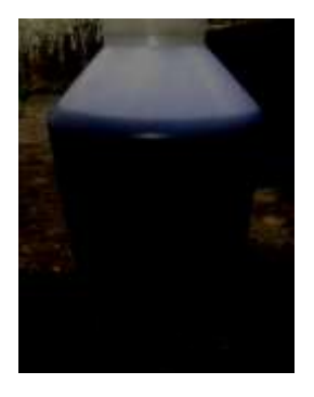
Fig -1: Collected Effluent