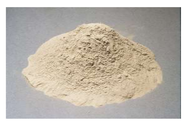
Fig -1: Fly Ash

In the case that fly or bottom ash is not produced from coal, for example when solid waste is used to produce electricity in an incinerator, this kind of ash may contain higher levels of contaminants than coal ash. In the case the ash produced is often classified as hazardous waste.