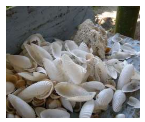
Fig -2: Sea Shell

Apart from mollusk seashell, other shells that can be found on beaches are those of barnacles, horseshoe crabs and brachiopods. Marine annelid worms in the family serpulidae create shells which are tubes made of calcium carbonate that are cemented onto other surfaces. The shells of sea urchins are called tests, and the moulted shells of crabs and lobsters are called exuviae. While most sea shells are external, some cephalopods have internal shells. Seashells have been used for many different purposes throughout history and prehistory. However, seashells are not the only kind of shells in various habitats, there are shells from freshwater animal such as freshwater mussels and freshwater snail, and shells of land snails.