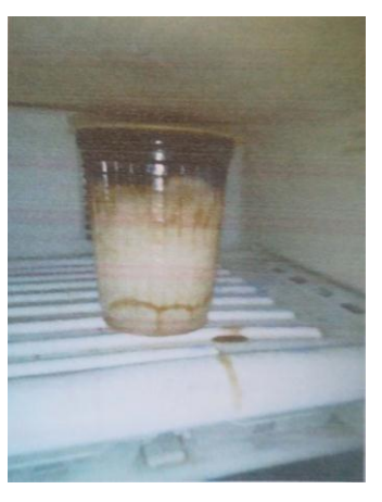
Fig. 4.3: Testing of sample in ordinary Freezer