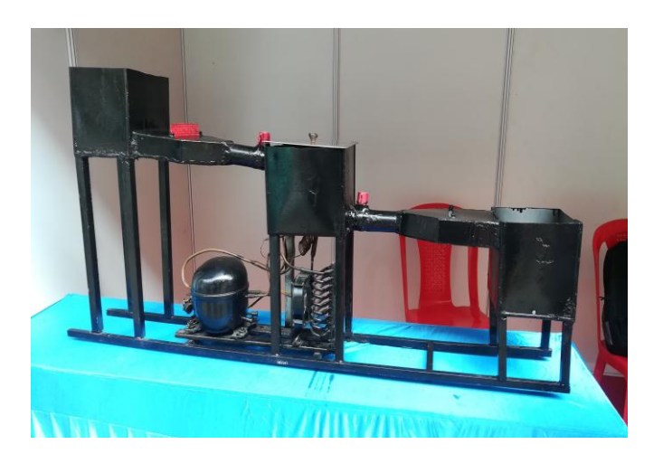
Fig. 7 Prototype

There are several redress techniques out there to treat the oil-contaminated sites in offshore similarly as onshore; but, the removal potency of those strategies depends on the sort of oil, type of soil, weather, penetration depth, sensitivity of the situation and also the toxicity of the chemicals. When the contaminated water freezes, due to the differences in the densities and different freezing points the oil settles in the top. It resembles oil on a solid material. So, that oil can be removed easily. However, if oil spills or leakages occur, response ought to be taken right away to reduce the potential environmental consequences. The BOD and COD levels showed significant decrease. The suspended solids had a great decrease from 1900 to 129 in 1 liter sample. This method can built in every resident and ground water can be purified with help of this method. This method can also be used in marine oil spills to a certain extent. If the water is cooled the oil can be easily removed. The percentage of treatment was found to be 90-95%. The treated water has less suspended solids. So that some other simple water treatment process such as reverse osmosis can be utilized for more purity.