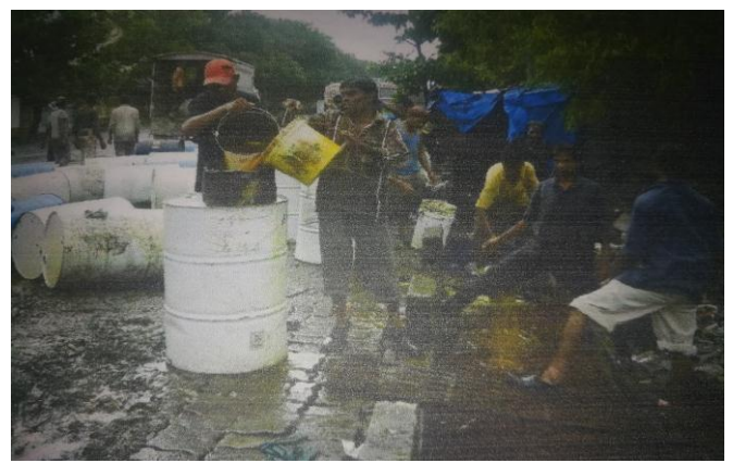
Fig. 4.1: Crude oil leak

Several such pipelines cut through populated areas and the leaks, contaminated the groundwater that residents draw up with the help of bore wells and use for drinking, cooking and bathing.