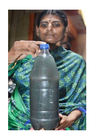
Fig. 4.2: Sample contaminated Groundwater

Groundwater sample was obtained by the help of motors as the bore well connections were discarded due to pollution. It was collected in pre-sterilized 10 liter container from a housing board in Tondiarpet, North Chennai that has its water source from a borehole within the city.