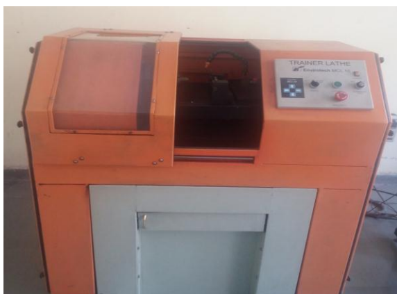
Fig -1: CNC lathe machine mcl10

The experiments were performed on CNC Lathe machine MCL 10. In this experimentation the work piece material was AA-1199 aluminum alloy. The length and diameter of each specimen was 350mm and 30 mm respectively