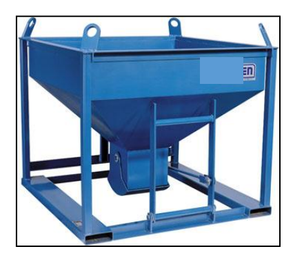
Figure -2: Hopper

A storage container used to dispense granular materials through the use of a chute to restrict flow, sometimes assisted by mechanical agitation.