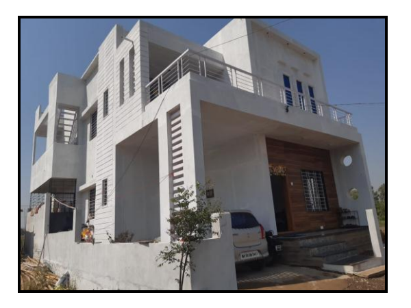
Figure -1: Proposed Residential Building.

Our main focus is to produce the electricity with the help of solar panels system for achieving the Net Zero Residential Building.