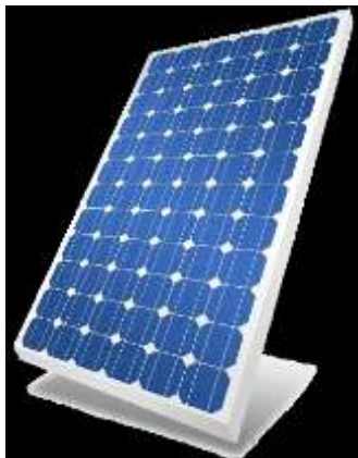
Fig : 2. Solar pv cell

Solar electricity system absorb the sun energy using PV cell .The cells convert the sunlight into electrical energy .Solar power from PV cells are made from semiconductor material. The PV cells are made from crystalline silicon & that includes such as polysilicon & monocrystalline silicon.