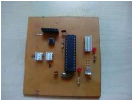
Fig: 5 Arduino Uno