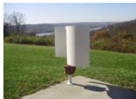
Fig: 4. Vertical Wind Mill

In our project, wind direction does not matter it adjust itself in the wind direction and its efficiency is 50 to 66%. It works at lower wind speed, it having silent operation and light weight tower.