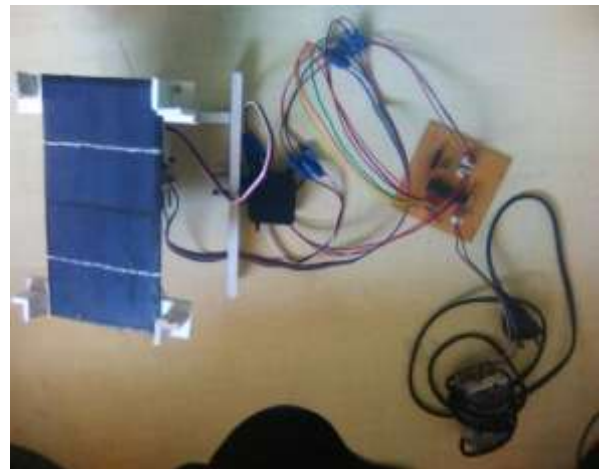
Fig: 3 solar tracking system.

Due to the dual axis solar tracking system we generate maximum electrical energy.