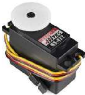
Fig: 6 Servo Motor

In our project servo motor is used to rotate solar panel in the direction of sunlight. Servo motor is controlled with electric signal which determines the amount of movement the shaft.