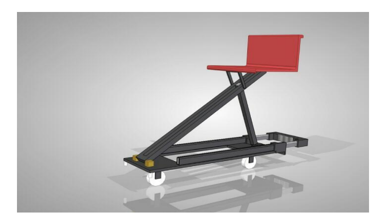
Figure 3: View of Sitting Arrangemnet.