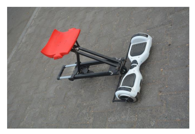
Figure 5: Original Picture of Segwalk 11.