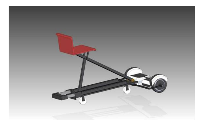
Figure 4: Side View of Segwalk 11.