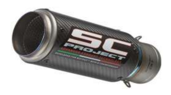
Fig. SC Exhaust in which db killers are fitted