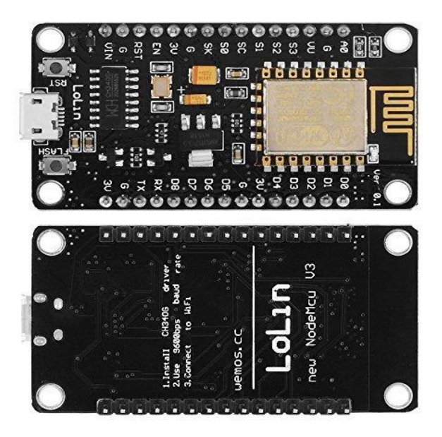
Fig No-2: NodeMCU Front and Back Side

NodeMCU is an open source IoT platform. It includes firmware which runs on the ESP8266 WiFi SoC from Espressif Systems, and hardware which is based on the ESP-12 module.<sup>[1][2]</sup> The term "NodeMCU" by default refers to the firmware rather than the development kits. The firmware uses the Lua scripting language. It is based on the eLua project, and built on the Espressif Non-OS SDK for ESP8266. Node MCU has 128kB internal RAM and 4MB external flash. It works on 80-160MHz clock frequency.