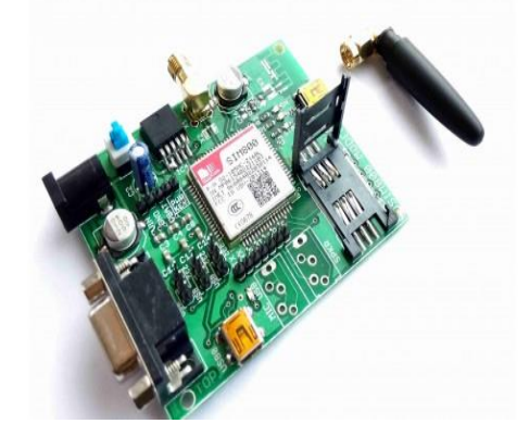
Fig -2: GSM Module

mobile phone that provides GSM modem capabilities. In this system by using the GSM modem when some accidents occur, it sends message to authorized bank people and police station. Most GSM networks operate in the 900 MHz or 1800 MHz bands. Using GSM Modem in the ATM System: In this system by using the GSM modem when some accidents or robberies is happen, then it will send the message to according to Bank authority and near police station (PS) corresponding to the controller.