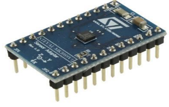
Fig -3: MEMS Sensor

MEMS stands for Micro Electro Mechanical Systems, it defines mechanical structures fabricated with IC processing on (most often) silicon wafers. The MEMS-based on the accelerometers are available in 1-, 2- and 3-axis configurations, with analog or digital output, in the terms of low-g or high-g sensing ranges. In this system we will be using a MEMS motion sensor (piezoelectric transducer) to find disturbance or vibration from ATM machine whenever robbery occurs. It is 3-Axis Accelerometer with Digital Output (I2C). It is a very low power, low profile capacitive MEMS sensor featuring a low pass filter, compensation for 0g offset and gain errors, and conversion to 6-bit digital values at user configurable samples per second. The device can be used for sensor data changes, product orientation, and gesture detection through an interrupt pin (INT). The device is housed in a small 3mm x 3mm x 0.9mm DFN package.