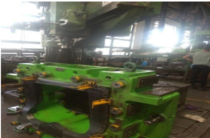
Fig-7.2: Drilling on Blank Holder