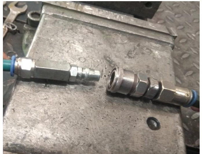
Fig-6.2: Pneumatic Connector

Pneumatic instrumentality is push to attach kind instrumentality. Push-to-Connect fittings alter fast tube affiliation and disconnection. a range of Male and feminine Connectors, Elbows and Tees feature tube ODs starting from 1/8 to 3/8 and 10-32, 1/8 NPT or 1/4 NPT threads. To confirm a leak proof work, thread sealer is normal on all male pipe threads and therefore the 10-32 UNF thread options associate O-ring for a superior seal.