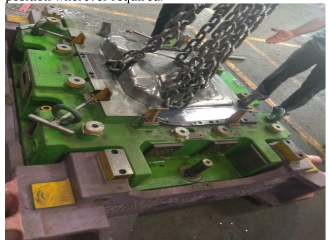
Fig-7.1 : Removing of blank holder

The blank holder is removed from the cavity with the help of overhead crane which is present in the industry. With the help of crane we can move the die on entire shop floor wherever required and also can be tilted easily as per requirement. The screw fixtures are provided for lifting the blank holder and cavity and can be fixed at any position wherever required.