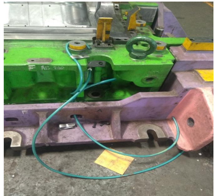
Fig-7.4: Clamping of pipes