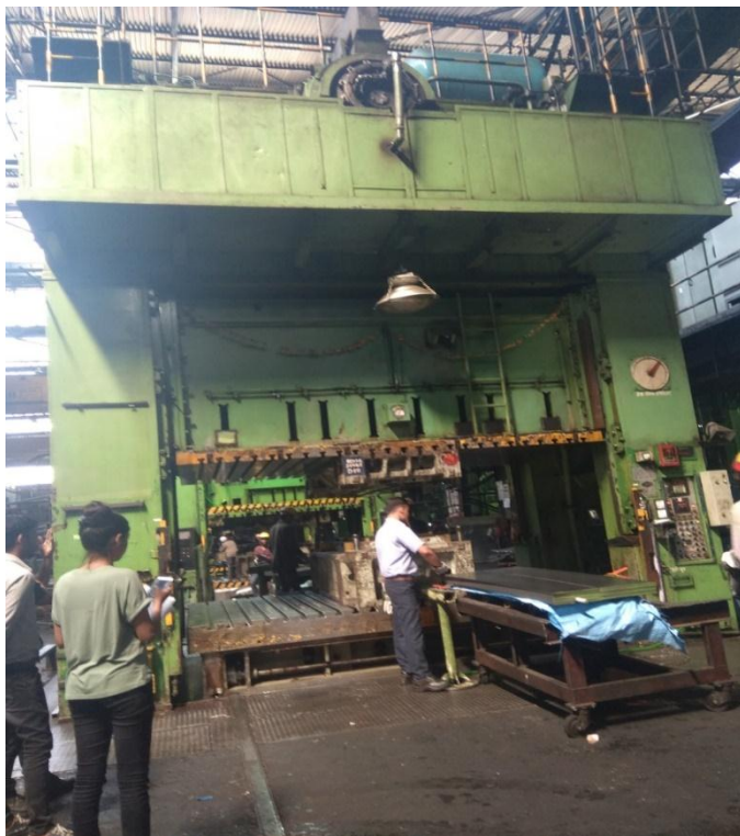
Fig -2.1: Hydraulic Press (1500 Ton)

A press could be a device employing a hydraulic cylinder to get a compressive force. It uses the hydraulic equivalent of a mechanical lever, and was additionally called a Bramah press once the artificer, Joseph Bramah, of England. He fancied and was issued a patent on this press in 1795. As Bramah (who is additionally proverbial for his development of the flush toilet) put in bathrooms, he studied the present literature on the motion of fluids and place this information into the event of the press