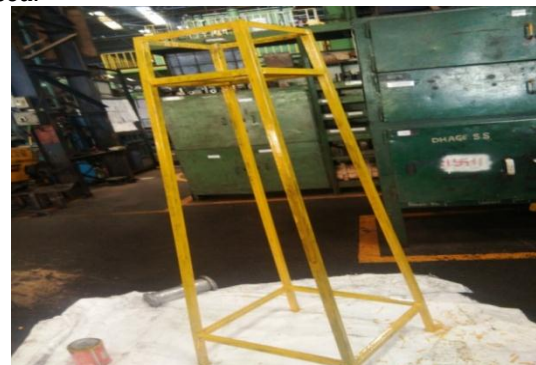
Fig-6.3 : Reservoir tank and stand

For placing the reservoir at certain height for eliminating the need of pump 6 0feet height stand is manufactured of MS material and at the top of stand reservoir oil tank is placed.