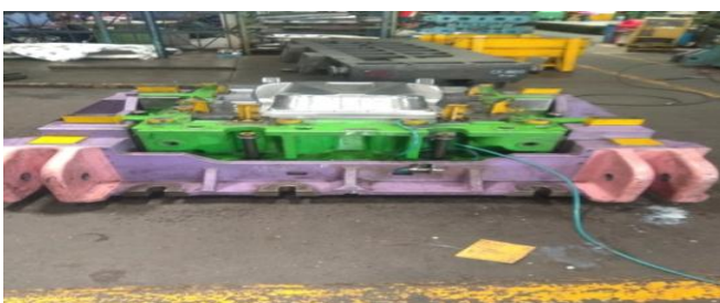
Fig-7.3: Mounting of blank holder

After the trial is done, we again mounted blank holder on lower die cavity using overhead crane.