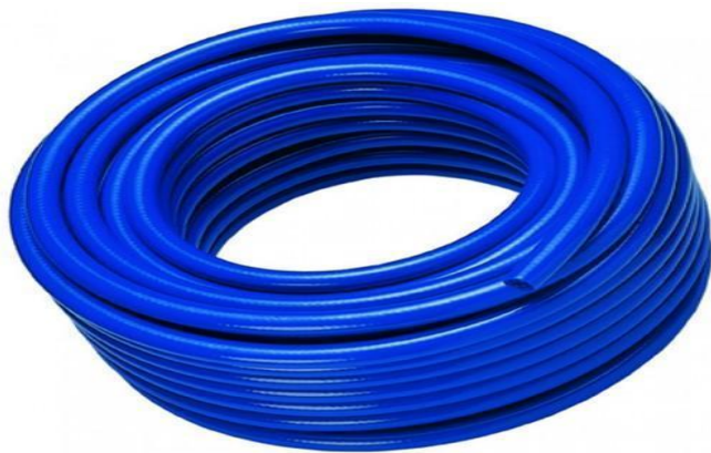
Fig-6.4: SMC PU10 PIPE