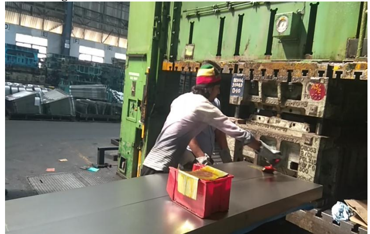
Fig-3.1: Manual Lubrication on lower die

process 2 to 3 workers are required. It takes almost 1 hour 30 minutes for whole process i.e. to remove the die, to lubricate it and fix it again on the machine. For manual lubrication workers uses lubrication kit. In this process first die is polished then lubricant is applied on it. The polishing process is done for removing the burrs and removing the unwanted particles. Due to this process the manpower required is more, 1.5 hour is required for lubricating a die which is more