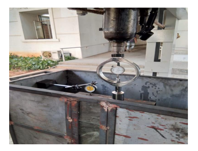
Fig-4 experimental setup

the footing settlement had stabilized. The settlements of the footing were measured by dial gauges. The placement of the soil, model footing, and confining box is shown in Fig-4. The test program consisted of carrying tests on combined footing to study the effect of soil over the soil-foundation response as shown in Table 2. Initially, the test has been carried out under axial load on the footing resting on the unconfined bed. The tests were carried out under smooth surface and rough surface to study the effect of settlement over soil.