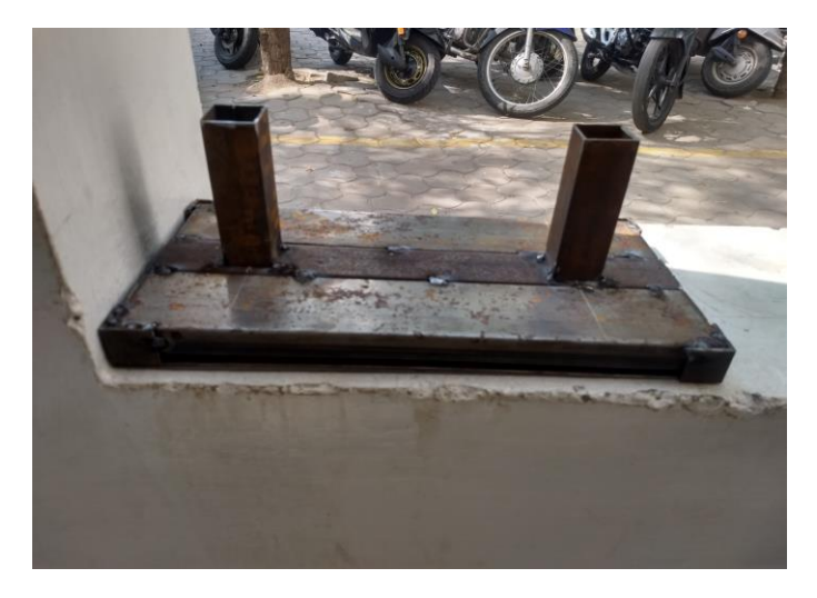
Fig 1-Model footing

400mmX400mm, Load on column A - 1200kn, Load on column B -1500kn, center to center between column A to B-2.5m, Soil bearing capacity -369.716Kn/m2. with the above details footing design was worked out as per footing design size of footing was 2mx4mand thickness of footing as 300mm with all above value a working prototype of footing was prepared, due to scale effect we prepared a steel footing instead of concrete footing of size 200mmx400mm with all necessary footing detailing like center to center distance and offset of edges from column faces as shown in Fig-1