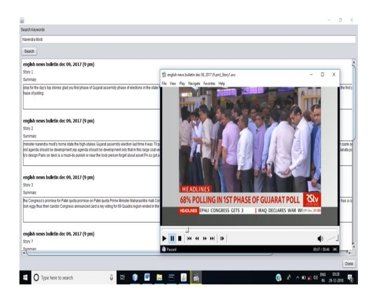
Figure-3: Keyword based News Retrieval System

The search GUI was designed to be a user friendly interface, which reduces users' learning time required to adjust to the interface.