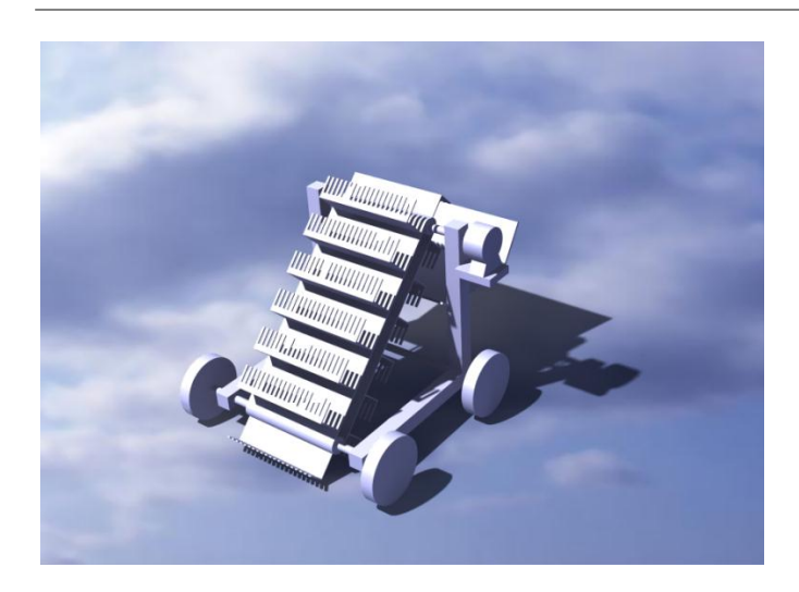
Cad model of drain cleaning machine

Volume: 06 Issue: 04 | Apr 2019 www.irjet.net p-ISSN: 2395-0072