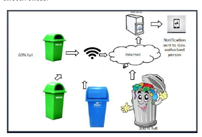
Fig 1.Process Diagram

We propose a savvy squander gathering framework. The information gotten through sensors is transmitted over the Internet to a server for capacity and handling systems. It is utilized for checking the day by day determination of wastebins, in light of which the courses to pick a few of the wastebins from various areas are chosen. Consistently, the laborers get the refreshed enhanced courses in their navigational gadgets. The huge highlight of this framework is that it is intended to refresh from the past experience and choose not just on the day by day squander level status. Additionally foresee future state as for components like traffic blockage in a region where the wastebins are set, costproficiency balance, and different components that is troublesome for people to watch and dissect. Accordingly, it tends to be anticipated before the flood of squanders happens in the wastebins that are put in a particular area. Contingent upon financial necessities determined at beginning times, the improved choice of wastebins to be gathered is relied upon to improve accumulation effectiveness.