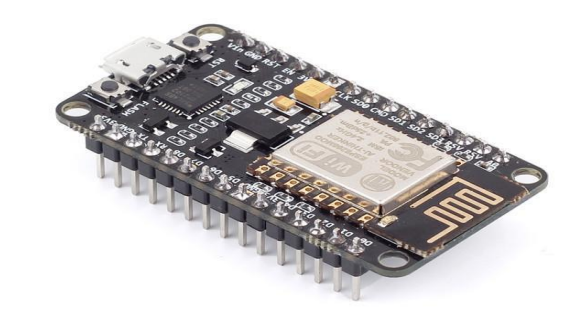
Fig 5. Wi-Fi Module

Wi-Fi Module is most driving gadget in the IoT stage what's more, it can speak with any microcontroller and make the undertaking remote. Also, ESP8266 is a minimal effort Wi-Fi microchip with microchip with full TCP/IP stack also, microcontroller capability. It comprises of ESP8266 with 1MiB of implicit blaze in this way, taking into account single chip gadgets equipped for interfacing with Wi-Fi. ESP8266 Wi-Fi Module is an independent SOC (System on Chip). This module has a sufficiently incredible on-board preparing a capacity ability. What's more, it has expanded the blaze circle from 512k to 1MB.It comprises of 8 pins and transmitter furthermore, collector pins are utilized for correspondence. It comprises of 64 KiB of guidance RAM, 96 KiB of information RAM. Does these highlights it is utilized for one of a kind IP address.