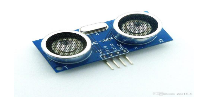
Fig 4.Ultrasonic Sensor