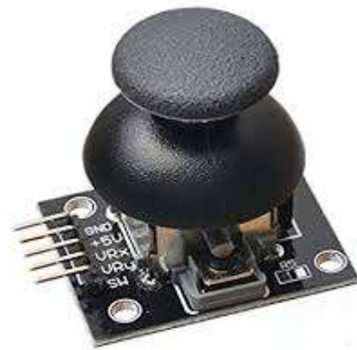
Fig-3 Joystick Module

The module gives analog output so it can be used for feeding the analog input based on direction or movement. It can also be connected to a movable camera to control its movement. We can use a Joystick Module with Arduino, Raspberry Pi and any other Micro-controllers.