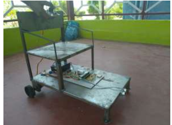
Fig-1:wheel Chair prototype

Abstract - While the needs of many individuals with disabilities can be satisfied with power wheelchairs, some members of the disabled community find it difficult or impossible to operate a standard power wheelchair. To accommodate this population, several researchers have used technologies originally developed for mobile robots to create "smart wheelchairs" that reduce the physical, perceptual, and cognitive skills necessary to operate a power wheelchair. We are developing a Smart Wheelchair Component System (SWCS) that can be added to a variety of commercial power wheelchairs with minimal modification. This paper describes the design of a prototype of the SWCS, which has been evaluated on wheelchairs from four different manufacturers.