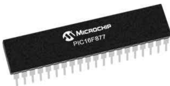
Fig- PIC16F877

The microcontroller that has been used for this project is from PIC series. PIC microcontroller is the first RISC based microcontroller fabricated in CMOS (complimentary metal oxide semiconductor) that uses separate bus for instruction and data allowing simultaneous access of program and data memory.