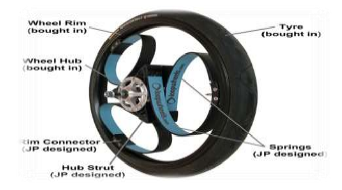
Fig-1 Loop wheel model

When load is applied on one loop the hub changes its centre of gravity and applies the load on the adjoining loops. The Loops are attached to the triangular joint using vertical screws. While the hub is joined to the triangular joint using horizontal screws. This load is then transferred by the loop to the hub which in turn transfers it to the other two loops, hence equal load distribution takes place. This reduces the vibrations considerably and ensures a smoother ride.