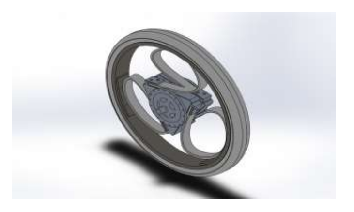
Fig-2 Loop wheel Assembly