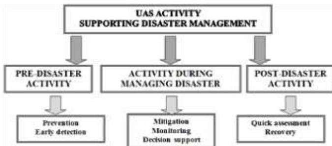
Fig 2: Block Diagram of Drone (UAV/UAS/RPAS) activity in time scale of disaster eruption.