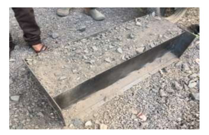
Fig -2: Prototype of Retaining wall

Using the rankine formula the calculation were done after applying the load i.e. soil load on the prototype of the retaining wall.