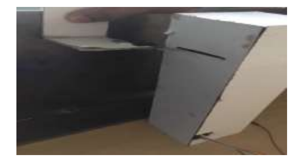
Fig 1- Sensors

Initally the sensor to be used was the infrared sensor but because of the precision issue a made sensor was used.