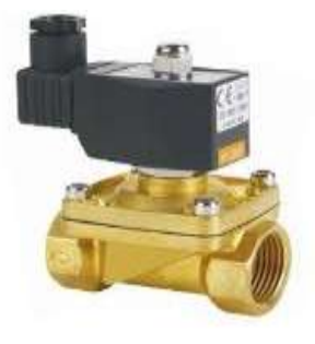
Fig 3 Solenoid Valve

Solenoid valve function as the electric current they use, the strength of the magnetic field they generate, the mechanism they use to regulate the fluid, the type and characteristics of fluid they control. Solenoid valve as also one of the mechanism varies from linear action, plungertype actuators to pivoted-armature actuators and rocker actuators. The valve can use as a two-port design to regulate a flow or use as a three or more port design to switch flows between ports. Number of solenoid valves can be put together on a manifold.