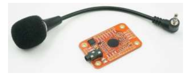
Fig 2 Voice Module V3

We have use the voice recognition module and it is electronic device which can accept the various human voice which can supports up to 80 voice command it speaker dependent voice recognition module .maximum 7 voice command can work at time, it has required sound could be trained as command, voice module board has 2 controlling ways: Serial Port is also known as full function and General Input Pins known as part of input pin. General Output Pins on the v3 model could generate several kinds of waves while corresponding voice command was recognized.