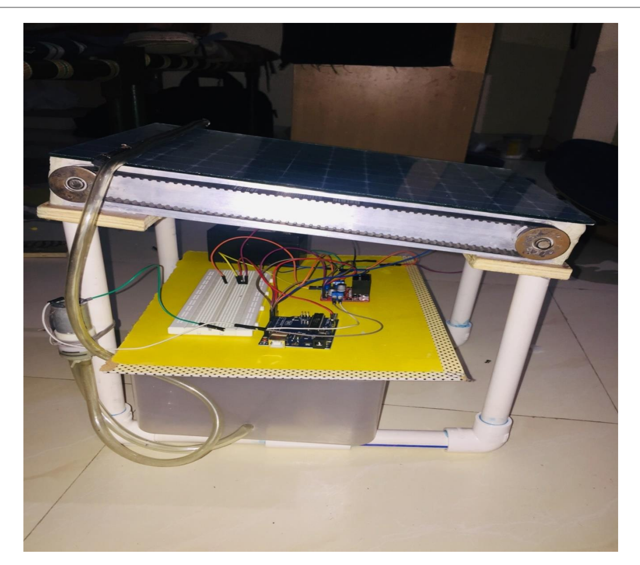
Figure.2.2: Whole System (side view)