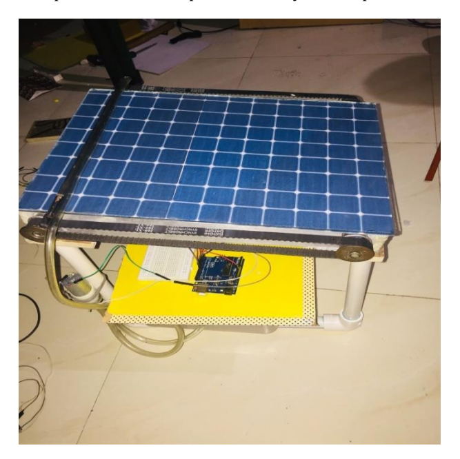
Figure.2.1: Whole System (top view)

The cleaning wiper moves on the surface part of the solar panel in a forward and backward motion. When switch is on then arduino circuit output given thought driver circuit to motor which runs in a forward direction.as soon as the motor start moving, the pump get in working mode and the spraying action starts. Wiper is mounted with belt which is guide by a timing pulley.in entire time of moving forward path, water spread on the solar panel and it's force to dust move in the direction of wiper motion and wiper clean the panel.after reaching edge of panel, according to arduino coding motor start to rotate in anticlockwise direction.when motor is moving revers direction the water pump gets off and the action of water spray is stop.wiper comes to the initial position and complete to one cycle and process to be stop.