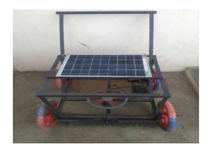
Fig -3: front view of grass cutter

The work layout shows the arrangement of 3 various parts of project. to the end of 3rd shaft and which is power transmit to the cutter mechanism