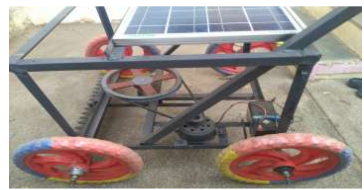
Fig-1: Side view of Solar Economical grass cutter

In our project, "crop cutter" is used to cut the different grasses or different crops for the different application.