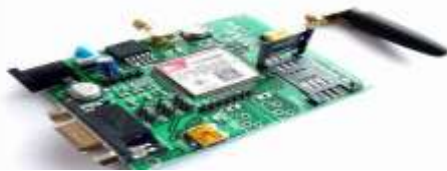
Fig-2 GSM Module

Global System for Mobile communication is a standard accepted worldwide for mobile communication. GSM/GPRS module is used for establishing communication link between a computer and a GSM-GPRS system. GSM is an architecture used for mobile communication in number of countries in the world. GPRS (Global Packet Radio Service) is an addition of GSM. It allows higher data transmission rate for the well-organized communication purpose. GSM/GPRS component consists of a GSM/GPRS modem assembled together. It is assembled among power supply circuit and communication interfaces like RS-232, USB, etc. for users computer. We are using Sim800 in our system.