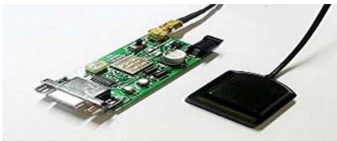
Fig-1 GPS module

technology can be used by any person having GPS on the earth.