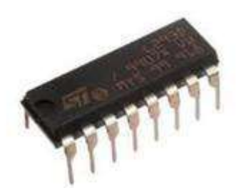
Fig-3 : Motor Driver

The AT89S52 provides the following standard features: 8K bytes of Flash, 256 bytes of RAM, 32 I/O lines, Watchdog timer, two data pointers, three 16-bit timer/counters, a six-vector two-level interrupt