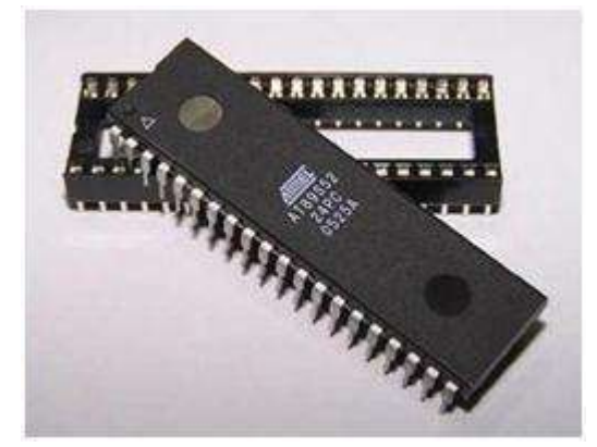
Fig-2: Microcontroller (AT89S52)