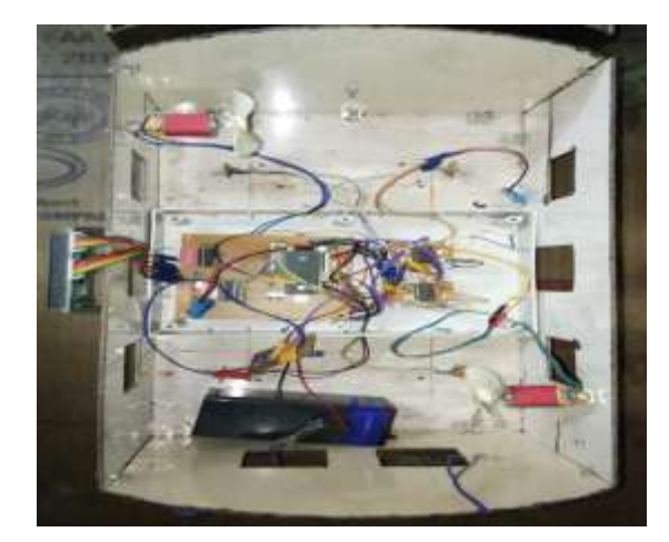
Figure No 7: Project Photo 2