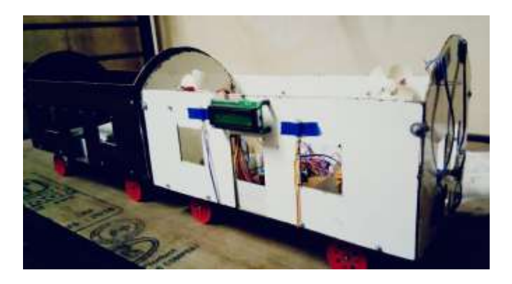
Figure No. 6 Project Photo 1

But by using our smart digi train method energy consumed is 12.44 kwh So 6.25 kwh of energy is saved on one platform for one day.