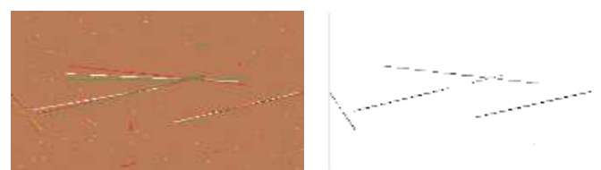
Figure 4: input-output