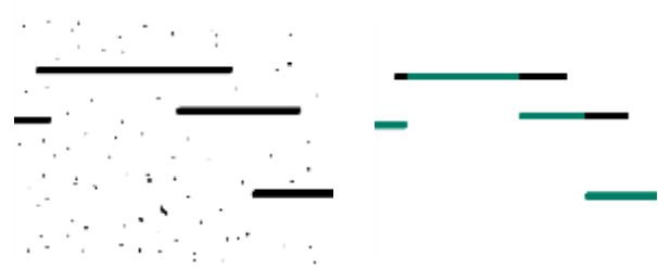
Figure 3: input-output

Here we used technique similar to Grassfire transform to remove the noise and to keep only that data which we want for recognition purpose. The algorithm checks the neighbouring 8 pixel of a pixel which we have implemented using recursion. If the number of pixels are less than a threshold count we consider it as noise and then convert it value to white. The lines which are hidden i.e observable from down are considered.