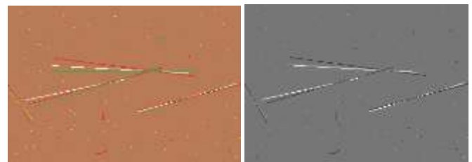
Figure 2: input-output