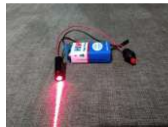
Figure 8: Laser line generator