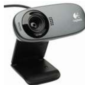
Figure 9: Webcamera