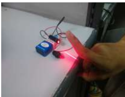
Figure 6: Input gesture

If this is the gesture done by user then the opera browser will be opened on your laptop/desktop.