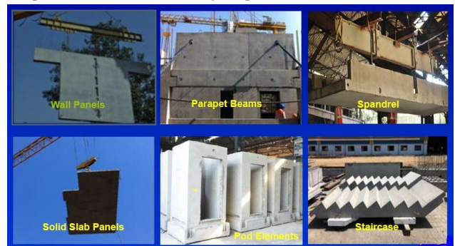
Fig.4 – A Typical working of a Precast Large Concrete Panel System

Precast Large Construction Panel (PLCP) system is a structural system comprising of various precast elements such as walls, beams, slabs, columns, staircase, landing and customized elements. There are two types of precast concrete elements, namely precast reinforced concrete elements and precast pre-stressed concrete elements, prefabricated in a precast yard or site. The precast elements are installed on site and supported by temporary jacks. Shims are used to carefully align the elements and grouted after the final adjustments. A typical construction involves design, strategic yard planning, lifting, handling, transportation and assembly of precast elements.