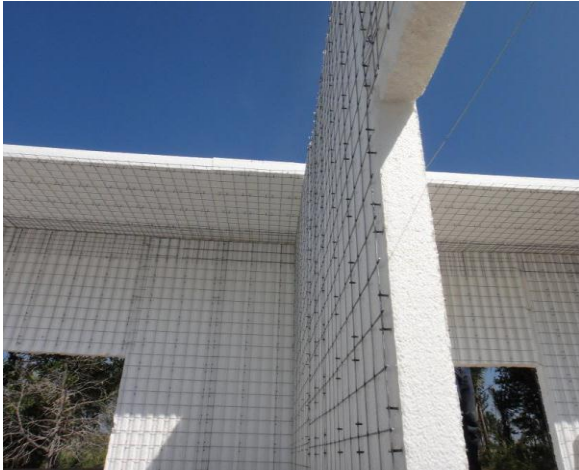
Fig.5 – A Typical working of a SIP panels