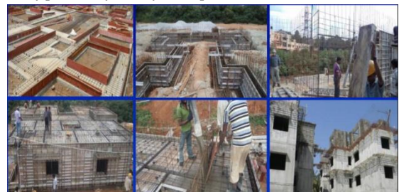
Fig.1 – A Typical working of a Monolithic Concrete Construction Technology

The conventional mode of construction is RCC framed structure with infill masonry walls whereas in this system, all walls, floors/slabs, stairs together with door & window openings are cast in-situ monolithically using specifically custom designed modular formwork made up of aluminum/plastics/steel/ composite.