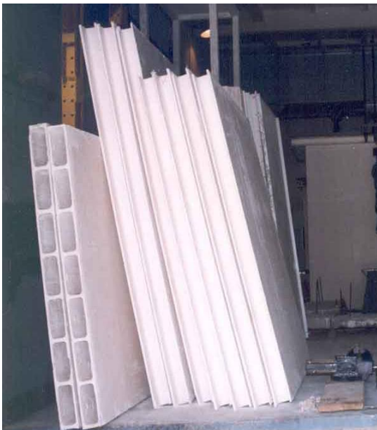
Fig.6 – A Typical GFRG panels

GFRG is an integrated composite building system-using factory made prefabricated load bearing cage panels and monolithic cast in-situ RC in filled for walling and floor/roof slabs, suitable for single storey to ten-storey building. It is made of calcined gypsum plaster, reinforced with glass fibers and panels manufactured to a thickness of 124 mm under carefully controlled conditions to a length of 12 m and height of 3m, contains cavities. The panels are being produced at FRBL Kochi and RCF Mumbai and being promoted by IIT Madras.