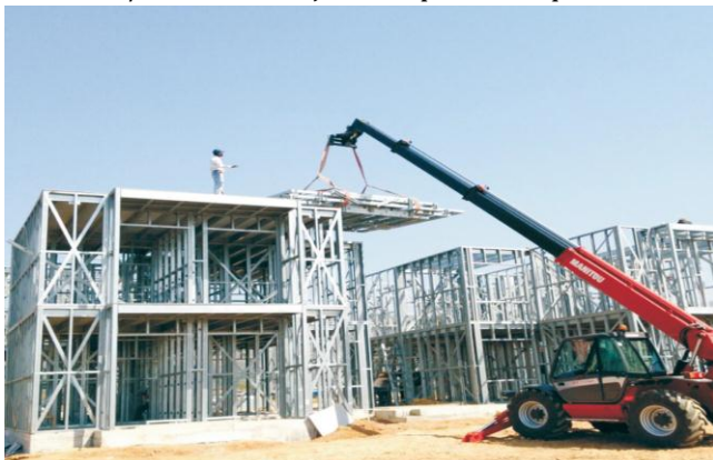
Fig.2 – A Typical working of a LGSFS

Light Gauge Steel is cold form steel which has an advantage over hot rolled steel as it is lighter in weight and on thin sections of any form can be manufactured. Normally, LGSFS is factory made galvanized light gauge steel components assembled as panels at site and suitable for 3 to 4 storey structures. The infill walls can be of any material ranging from precast boards, blocks, EPS panels or an external layer of insulation material and outer leaf of CP Board or dry mix shotcrete. The floor/roof can be RCC/ Steel truss /Steel deck on joists as per the requirement.