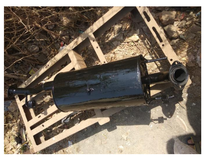
Fig -3: Modified Aqua Silencer

In modification of the Aqua Silencer we modify the design of the outer shell and perforated tube dimension. Then we replace the Lime water to Charcoal water. The test setup on silencer of diesel engine.