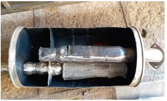
Fig -2: Inner view of modified Aqua Silencer