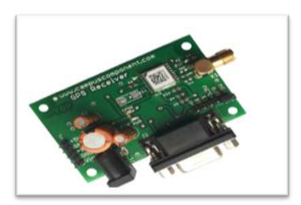
Fig.1- GPS Module

International Research Journal of Engineering and Technology (IRJET)e-ISSN: 2395-0056Volume: 06 Issue: 04 | Apr 2019www.irjet.netp-ISSN: 2395-0072