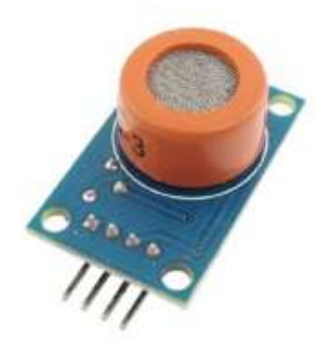
Fig: Alcohol sensor

This alcohol sensor is having capability for detecting alcohol concentration on your breath, just like your common breathalyzer. It gives a high sensitivity and fast response time. It provides an analog resistive output based on alcohol concentration. The drive circuit of this sensor is very simple, all it needs is one resistor. A simple interface could be a 0-3.3V ADC