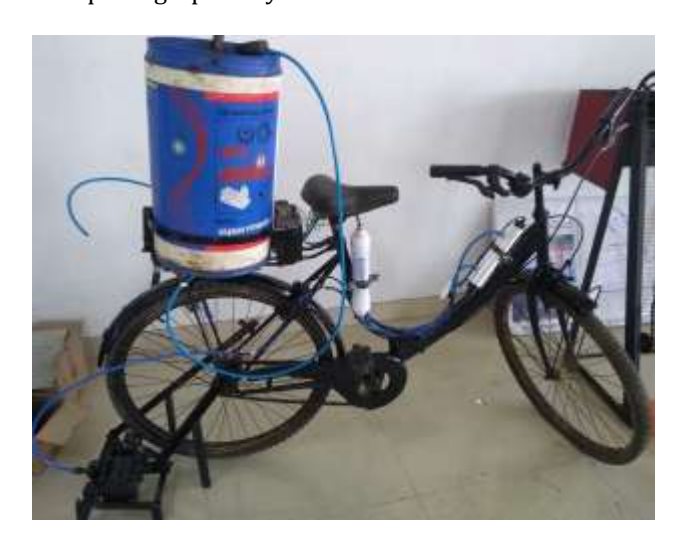
Actual photograph of system