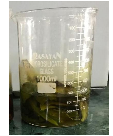
Figure 3 boiled cauliflower solid waste