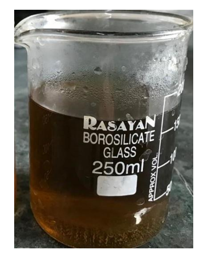
Figure 4 EXTRACTED CAULIFLOWER SOLUTION

Step 3 -After 24 hours , the amount of dye extracted was calculated through colorimeter.