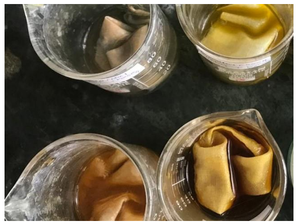
Figure 5 COTTON CLOTH DIPPED INTO SOLUTION