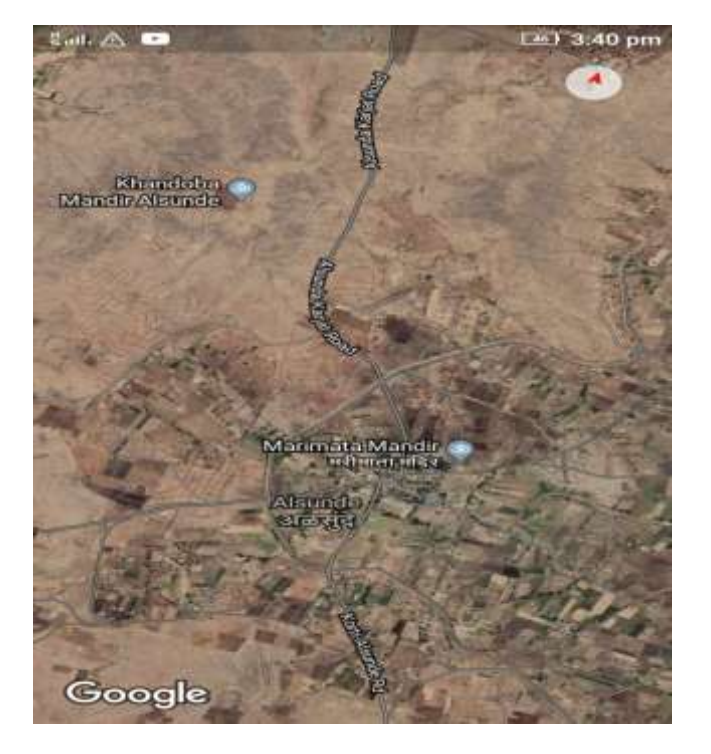
Loation of Alsunde