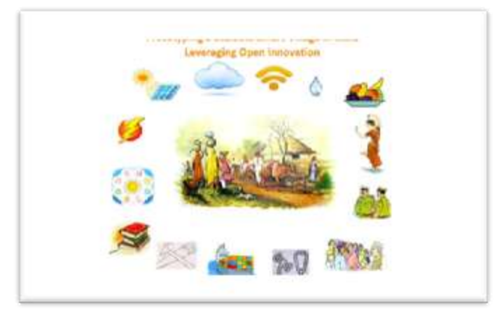
Fig No.01- Requirement Of Smart Village

We know that India is a developing nation with the help of smart village we can make India as a smart nation. Now days our government also gives strong focus on smart village. Government implements so many schemes on smart village. Smart governance and educational Smart building Smart mobility.