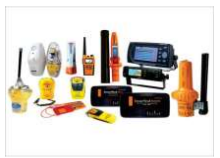
2.2 GMDSS Devices

Many of the merchant marine vessels nowadays are equipped with GMDSS radios, but still it is not so popular in Bangladesh due to need of registration of each station. Also, GMDSS enabled radios are costly in comparison to Bangladesh economy and especially for local fishermen.