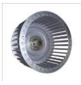
Figure 7: Mini Turbine

A mini turbine (Figure.7) connected with the stepper motor is used to tap the mechanical energy into electrical energy. The material used is Aluminium because of its low weight to power ratio, high strength to weight ratio & low corrosion rates. It was assembled with the frame by drilling and fastening of the screws and nuts using drilling machine, spanner and screw driver respectively.