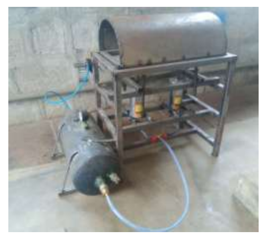
Figure 11: Working Model