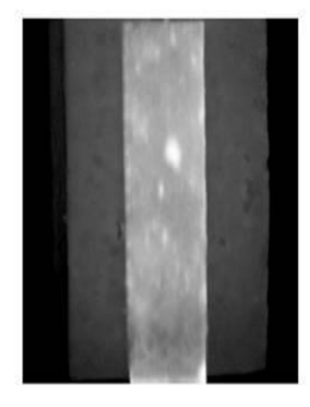
Fig 3.1.3:- Carbon fiber reinforcement of concrete structure

Figure 3.1.3 shows assigned of pipe delivering concrete; the leakage of slurry at the joints is discernible in the image. Any obstruction to flow can be observed from the temperature patterns of the thermal image. However, the dark patch on the pipe after the second joint from the left corner is not an obstruction in the flow, but, water spilled on the pipe, Figure 3.1. 3. The thermal image of concreting of a slab is shown in Figure 3.1.3. The concrete was cast on a hot day with temperature of about 40C. The concrete poured is cooler than the forms as can be seen from the colour pattern. The forms are at temperatures of about 40 - 44Cdue to exposure to direct sun, while the concrete is cooler at 32 -34C due to evaporation. The reinforcement bars of the column in the image are at about 38C. A person with a needle vibrator can also be seen in the image. The effectiveness of curing procedure adopted can be assessed by the camera. Figure 3.1.3 shows the concrete columns of a structure being cured. The image was taken at about 6.00 am (before sunrise) in summer. The bright columns at the right are at temperatures of 29 - 30C with little curing, while the columns with gunny bags wrapped around are cured better with surface temperatures at about 25C. However, the upper parts of the columns are not wrapped properly, and appear to have dried out with a surface temperature of about 28C.