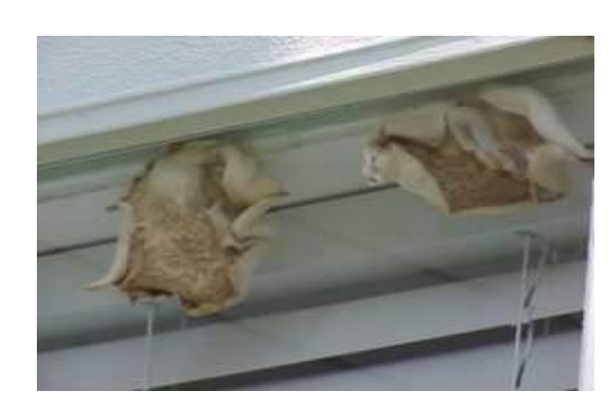
(a) Visual images