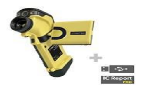
Fig -1: A typical infrared camera

thermal images of light bulb appears to glow as brightly in the total darkness after it is switched off.