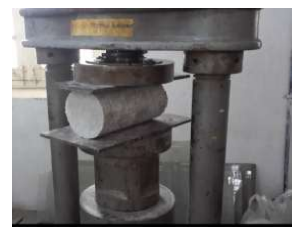
Fig 2: The Split Tensile Strength test setup