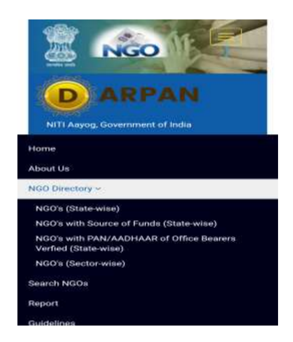
Fig -3: NGO Darpan

The NGO DARPAN has been maintaining under aegis of the NITI Aayog. NITI Aayog invited all of the Voluntary Organizations (VOs) and the Non-Governmental Organizations (NGOs) for registering in the portal. This portal enabled all the VOs/NGOs in India to enroll and hence facilitated the creation of a repository of information about VOs/NGOs, Sector/State wise.