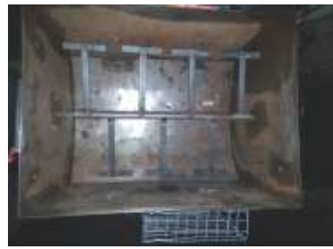
Fig 4. Stirrer of PCM

The process of compost in PCM follows the Aeration method of Composting.