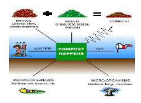
Fig -1: Composting process

scraps, and trusting that the materials will separate into humus following a time of months.