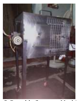
Fig 3. Portable Compost Machine