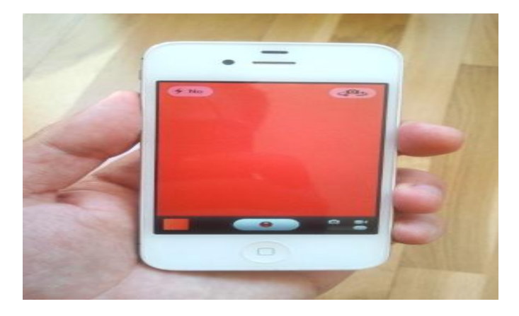
Fig -1: Detecting heart rate

The wearable health devices are highly expensive for the common users. In order to overcome this challenge, we have come up with an innovative idea which makes the device simple and affordable for health monitoring. For this we suggest connecting modules with the utilities that a person uses in his/her day to day life. One such thing that can be considered as the mobile device. The main modular device is connected directly with the help of camera sensor technology. In case of any illness occurring in the body of an individual, it affects the normal function of heart and result in change in body temperature. The change in heart rate can be monitored and recorded in order to analyze the result and take instant action by the user as well as the hospital linked to the patient remotely with the help of IoT technology.