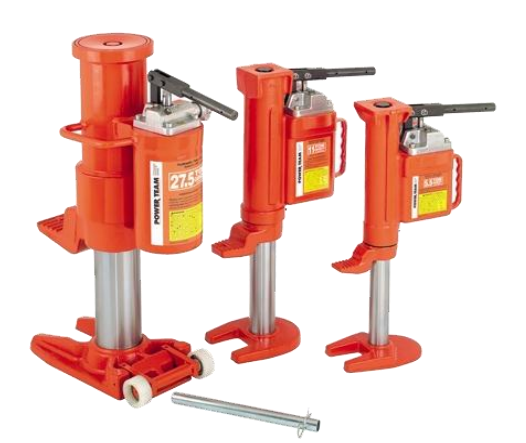
Fig-4 Toe hydraulic jack

Hydraulic toe jacks are a specialized jack for lifting or jacking masses with low clearance heights. Toe jacks as the decision implies characteristic a low foot or toe casting this is lifted by means of way of an internal hydraulic jack. They're in particular beneficial for lifting and positioning of heavy device or loads. They can also be used for lifting forklifts or low clearance equipment. Provided in pretty various capacities our toe jacks are immoderate excellent, durable, are from professional corporation proven manufacturers.