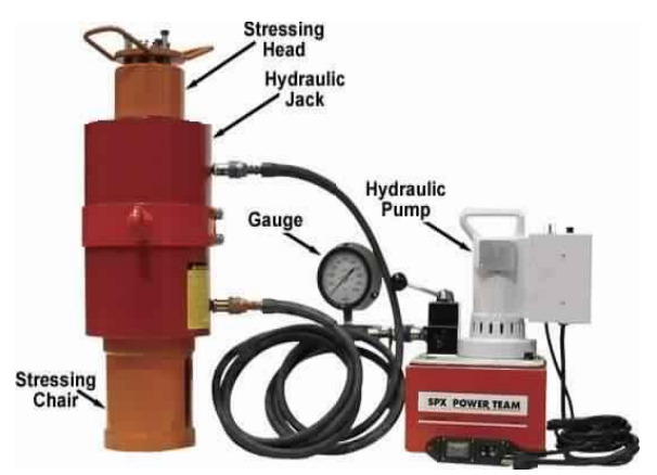
Fig-3 Strand hydraulic jack

Volume: 06 Issue: 05 | May 2019 www.irjet.net p-ISSN: 2395-0072