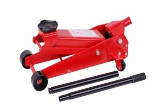
Fig-2 Hydraulic floor jack

In a floor jack a horizontal piston pushes on the short end of the bell crank, with the long arm providing vertical motion to the lifting pad, kept horizontal with horizontal linkage. Floor jacks usually include castors and wheels, allowing compensation for arc taken by the lifting pad. This profile provides low profile when collapsed, for easy operating underneath the vehicle while allowing considerable extension.