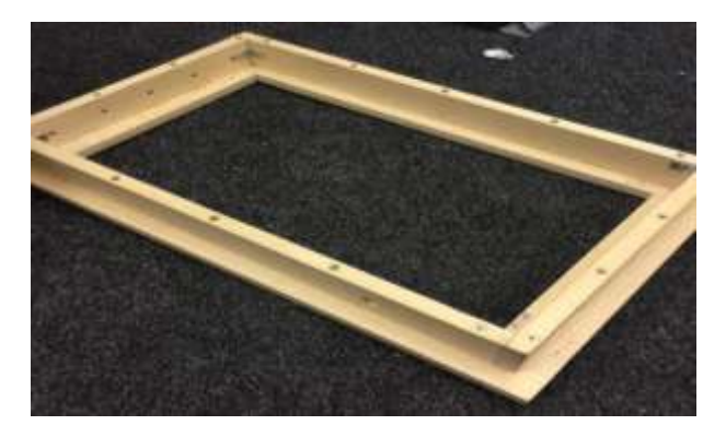
Figure 3: Wooden Frame

Fig 3 Magic Mirror UI The date and time displayed at the top left of the screen are accessed from the API key obtained from the Open Weather Map website. The news feed is obtained from the RSS file of the HINDU news.