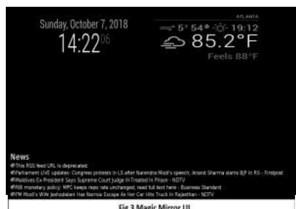
Fig 3 Magic Mirror UI The date and time displayed at the top left of the screen are accessed from the API key obtained from the Open Weather Map website. The news feed is obtained from the RSS file of the HINDU news.

After completing the installations of the module, it is made to run on the device using commands. The output of the code is shown below