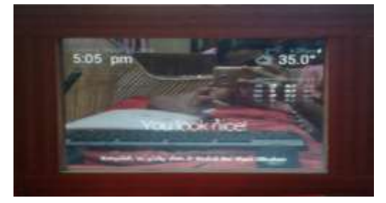
Figure 4: The Smart Mirror

When the hardware is interfaced with the software it looks something like Fig-4. The smart Mirror is used to make the life smarter and it is also used in implementing smarter home.