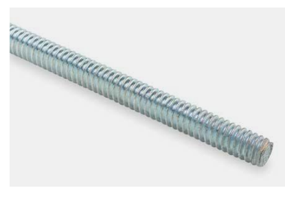
Fig-4: Threaded Rod

A screw thread, often shortened to thread, is a helical structure used to convert between rotational and linear movement and force. A screw thread is a ridge wrapped around a cylinder or cone in the form of a helix, with the former being called a straight thread and the latter called a tapered thread. A screw thread is the essential feature of the screw as a simple machine and also as a fastener.