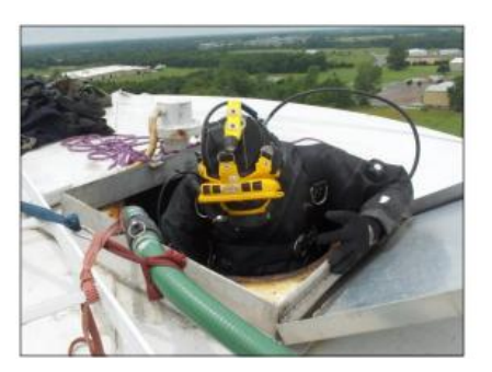
Fig-1: Conventional Water Tank Cleaning

Manual scrubbing in which wall and floor of tank are scrubbed to remove dirt, sediments, fungus and stains, but this method is more tedious and time consuming. The tank can also be cleaned by using chemicals to remove the dirt and sediments. The chemicals used may affect the human health. Pressurized water can be spraved on the walls of the tank which will remove the dirt from the tank surface. These methods are time consuming and require more efforts for cleaning. To find such an approach, there is a need of studying the existing approaches and algorithms that had already been used for tank cleaning system.