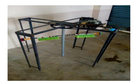
Fig-5: Final Project

Capacitors have a use of converting the 230v heavy input to 12 v input voltage for motor. Actually it's done by transformers but the capacitors have a use of storing the charge and release the same.