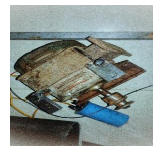
Fig-3: Induction Motor

An Induction motor or a synchronous motor is an AC electric motor in which the electric current in the rotor needed to produce torque is obtained by electromagnetic induction from the magnetic field of the stator winding. An induction motor can therefore be made without electrical connections to the rotor. An induction motor's rotor can be either wound type or squirrel-cage type.