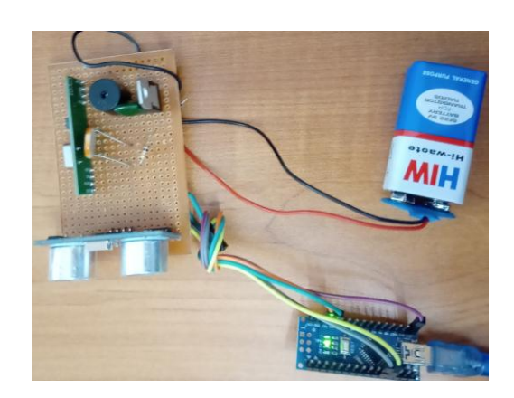
Fig. Circuit diagram of device.

Light detection - The light detection is done by the LDR sensor and is used to detect the dark places. The sensor connected to a voltage divider circuit output an analog voltage at the interfaced controller pin. The analog voltage is read and digitized using inbuilt ADC channel [4-5].