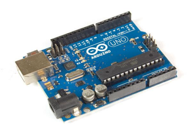
Fig. 5. Arduino UNO

amount of drug is going to dispense, how much degree should be given to motor to perform motion of lead screws. perform different calculations to mix drugs like how much amount has to be mixed, from which container how much To compile the whole program and run we just need arduino software installed in our laptop. It gives 5 volts of output, so we have connected a 12V adapter to arduino to drive driver IC's. which require that much amount of supply. Debugging is quite easy if someone knows about arduino little bit. So by using arduino we control the whole operation sets of our drug dispensary system.