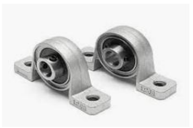
Fig. 4. Ball Bearing

A bearing is like a rolling element which uses balls to allow separation between the bearing races. Main feature of ball bearing is that it cut back the friction and supports the radial and axial movements. So we used bearing with lead screw to allow its movement radially and movement of lead screw through bearing up and down. Ball bearing contains balls and these balls transmits masses through it. Here bearing is fixed in one place and lead screw is moved through it using balls in bearing for mixing of drugs in precisely manner. Bearings require only small maintenance like oiling, changing of balls so it is quite easy for maintenance purpose.