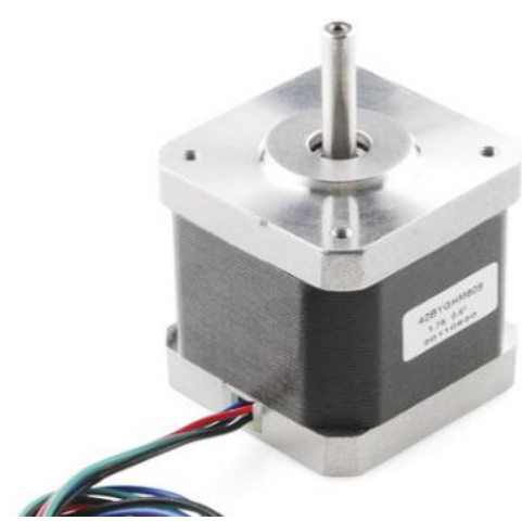
Fig. 2. Stepper Motor