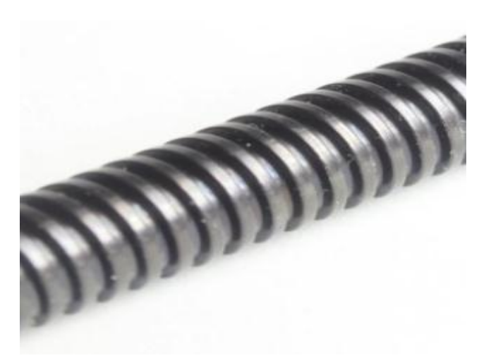
Fig. 3. Lead Screw

Volume: 06 Issue: 05 | May 2019 www.irjet.net p-ISSN: 2395-0072