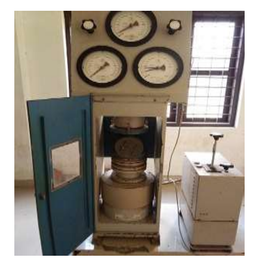
Fig-3: Cylinder testing in compression testing machine

3 Cylinders of diameter 150mm and length 300mm size specimens were cast. The split tensile strength of the NWC and MWC cylinders were conducted after 7 days and 28 days of curing.