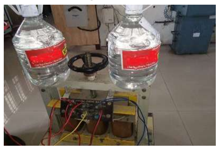
Fig-2: Magnetic water equipment system