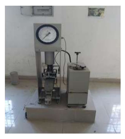
Fig-4: Beam testing in flexure testing machine

3 Beams of size 10cm*10cm*50cm specimens were cast. The flexural strength of the NWC and MWC beams were conducted after 7days and 28 days of curing.