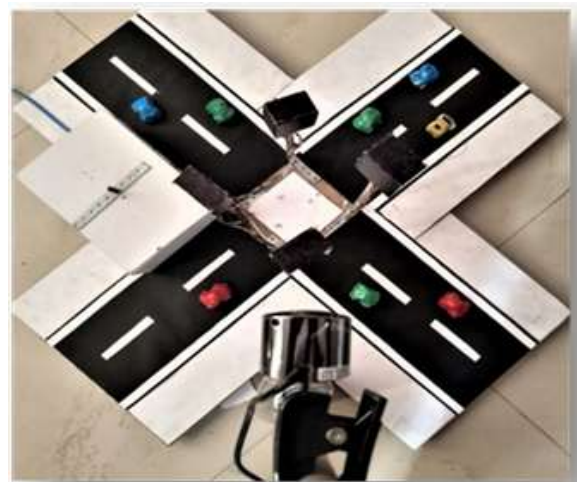
Figure 2: Hardware Setup

The hardware setup consisting of a camera module placed on the top of miniature traffic model is shown in Figure 2