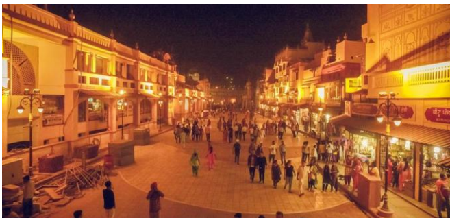
Figure 5: Heritage Street, Amritsar

The fusion of elements from Mughal and Rajputana architecture impresses the whole street form. Elements like Arches, Jalis, Pediments; Columns etc. together have a unique play. The continuity among the structures in terms of façades, regardless of their typologies evokes same language. The articulation was done without disturbing the inner space. The streets have become lively and more interesting, housing people till late hours. The development gave an amazing boom to the tourism with the flow to adjacent structures like Sikh museum, Jallianwala Bagh etc. as well. The development glorifies the City. before tourist normally visited the city for one or two days visiting the Golden Temple and other monuments, but this beautiful development has definitely increased their stay.