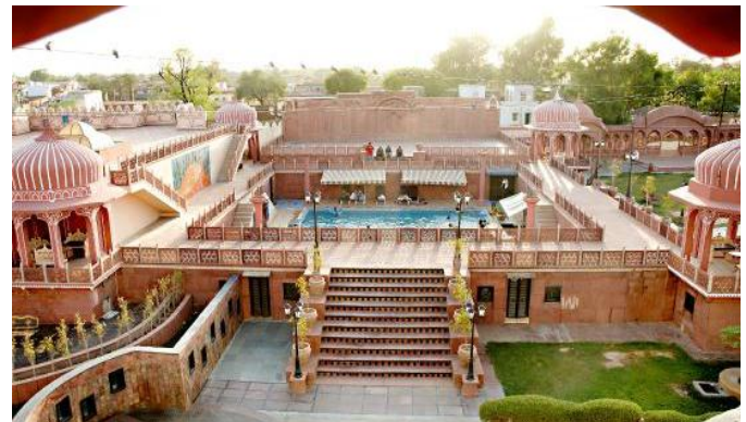
Figure 4: Beautiful Viewing Spots

There's an attempt in creating a Craft's bazaar which depicts the art and craft from 9 different states majorly the distinctive states like Jammu & Kashmir, Gujarat, Rajasthan, Kerala, Goa, Sikkim, Maharashtra, Tamil Nadu and West Bengal. This Haat is built like a giant map of the country.