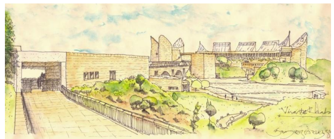
Figure 3: View of Museum

The building introduces itself with all the rich heritage glory, clad in sandstone as the feature of Fort Architecture. The big volumes get the influence from the surrounding Gurdwara which is situated on a small hill. The majestic structure impresses the visitors.